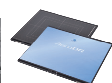
Our first cassette-type digital X-ray system