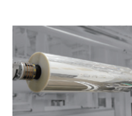
TAC film for LCD TVs

In 2003, Konica and Minolta, both rooted in imaging, integrate their managements. With the combined strengths of the two companies, we are pursuing a genre-top strategy to establish the top position in growth areas. In view of the social issues for 2030, we are contributing to help our corporate clients and are to solve these social issues as we develop intimate ties with people throughout the world who are on the front lines of various industries and lines of work.