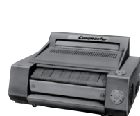
Our first copier

Both companies launch a number of products with world-first functions. Also, with the beginning of color television broadcasting, they embark on the development of TV color analyzers that measure display functions. Furthermore, they began developing copying machines, using technology derived from cameras, as office automation spread throughout corporations, expanding their business.