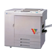
Our first digital full color copier

As telecommunications and digital technologies develop, the companies turn copiers into multi-functional digital color MFPs and launch the household optical discs pickup lens business for CDs and DVDs and the TAC film business for polarizers for LCD TVs. Utilizing the optics, materials, and imaging technologies developed over the years, they seized opportunities arising from changing times and start new businesses.