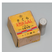
The first Japanese color film