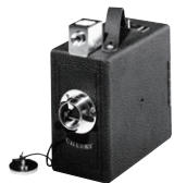
The first Japanese branded camera