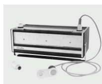
A TV color analyzer born from conversations with a TV station